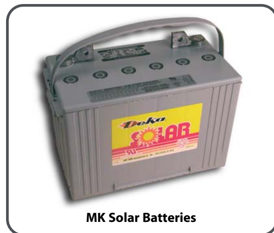
MK Solar Batteries

The Deka Solar Series of valve-regulated, gelled-electrolyte batteries are designed to offer reliable power for renewable energy applications where frequent deep cycles are required and minimum maintenance is desired. These batteries are sealed, but will vent at a pressure of 2 psi while being charged. Therefore, they require a ventilated enclosure to prevent gas build up. Maximum charging voltage should be at least 13.8 volts, but no more than 14.1 volts at 68°F. Two year warranty (One full and one pro-rated). We recommend these batteries for small to medium sized PV systems, from recreational vehicles to remote telecommunication sites.