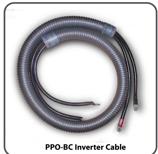
PPO-BC Inverter Cable