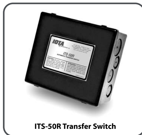
ITS-50R Transfer Switch